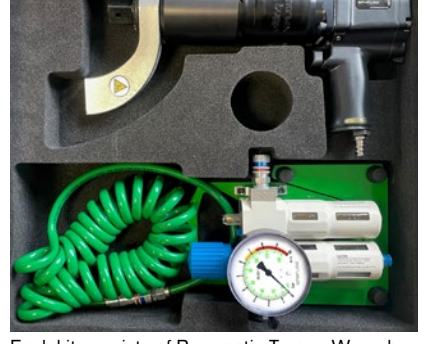
Each kit consists of Pneumatic Torque Wrench, Air Control Unit (NRP-CU), 4m Air Hose (AH4M), Storage Case (2010883), Calibration Certificate, Operating Manual/Parts List